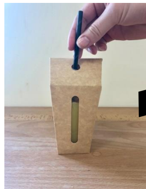
6 Straw through hold in top and serve.