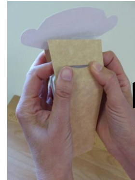
3 Fold in the upper sides.