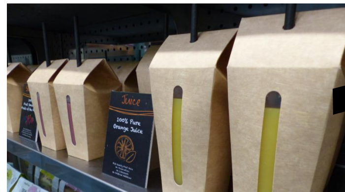
7 And ready for presentation.