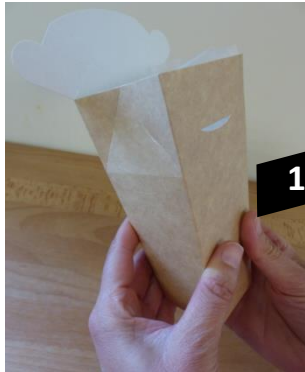
1 Squeeze gently on the sides.

This highly sustainable and innovative drinks packaging is perfect for Oranka's Grab 'n' Go concept. Suitable for filling and serving chilled juices and smoothies on site, whether used for take-away or as part of meal deals. To help with the green credentials, the unopened juices and smoothies only require ambient storage (so you can maximise refrigeration space) and come in 10 litre boxes with the minimum amount of packaging. Once opened the ready to drink juices and smoothies have a 30 day refrigerated shelf life, with the filled Pop-Up Cups staying fresh for up to 5 days when stored in the refrigerator.