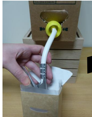
2 Fill the cup using the box, bag or jug.